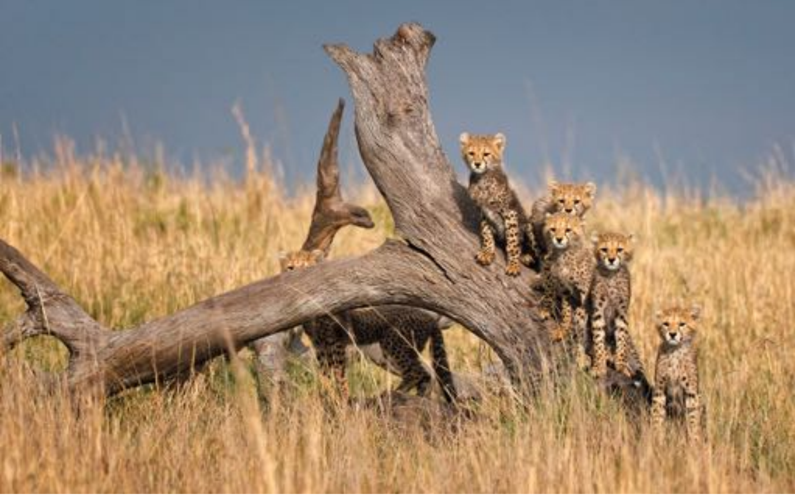
Cheetah mother Singo's cubs, Masai Mara, Africa, by Piper Mackay. Canon EOS 1D Mark III, focal length 700mm, f/13 at 1/2500 second, evaluative metering mode, auto exposure mode, ISO equivalent 2000.

As nature photographers and artists, we are enthralled with the world. Though most of us shoot a rich variety of scenes, we each have a special place—a favorite locale that always spikes our creative juice. A close friend of mine excels at shooting wild horses; another colleague revels in capturing the beauty of Washington's vineyards; other friends visit certain mountain areas year after year for the rush of capturing alpine beauty.