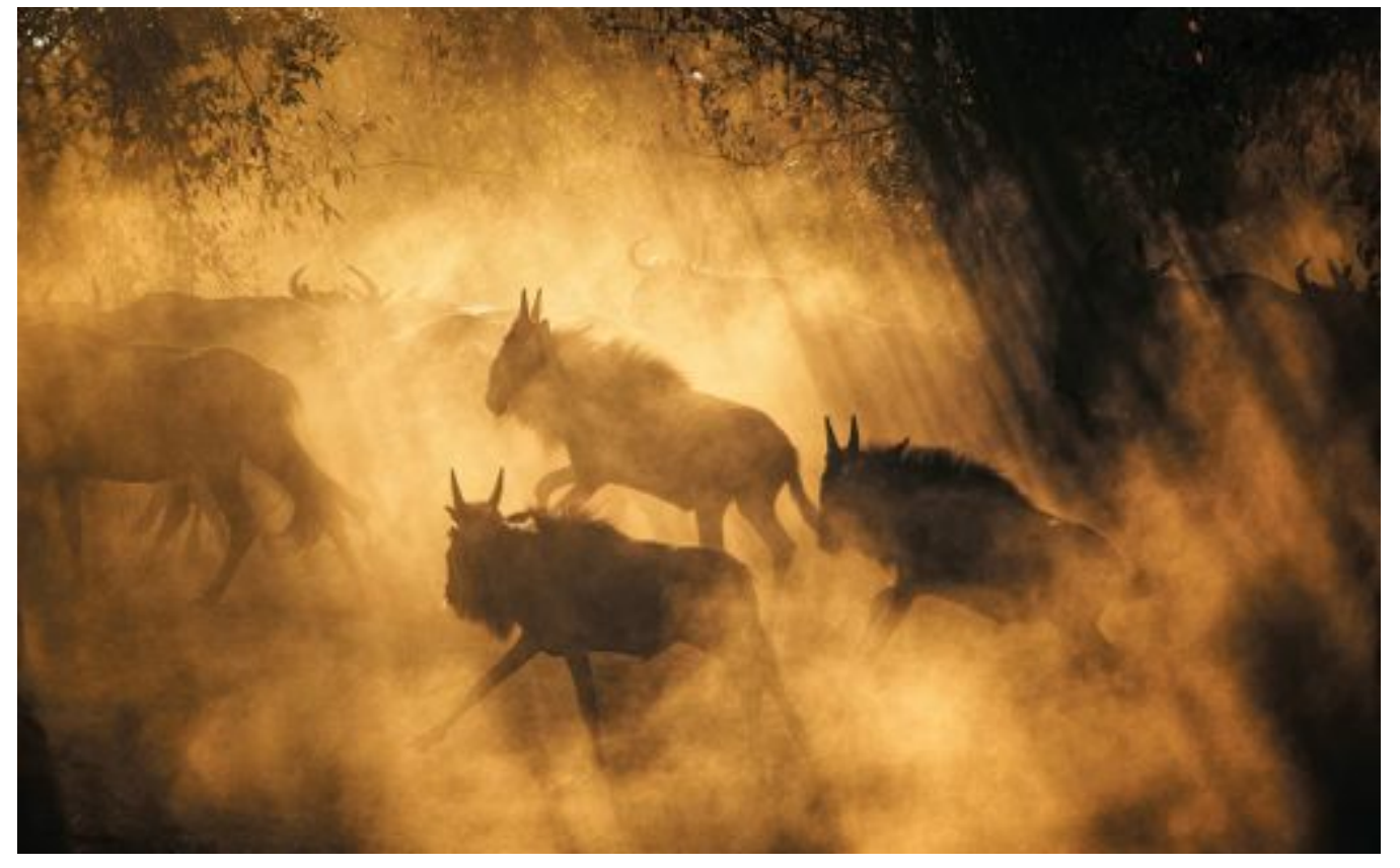
Look for moody elements such as dust and fog. Animals in the dust with great lighting make a very impactful image. This is another great time to add backlighting or side lighting. Backlighting will generally create a silhouette so I frequently prefer to use side lighting in these situations. The light filters through the elements for dramatic light but you can still make out some details in your subject.

Below: Canon EOS 5D Mark II, Canon EF70-200mm F2.8L IS lens with 1.4x teleconverter, focal length 215mm, f/4.5 at 1/2000 second, evaluative metering mode, auto exposure mode, ISO equivalent 200.