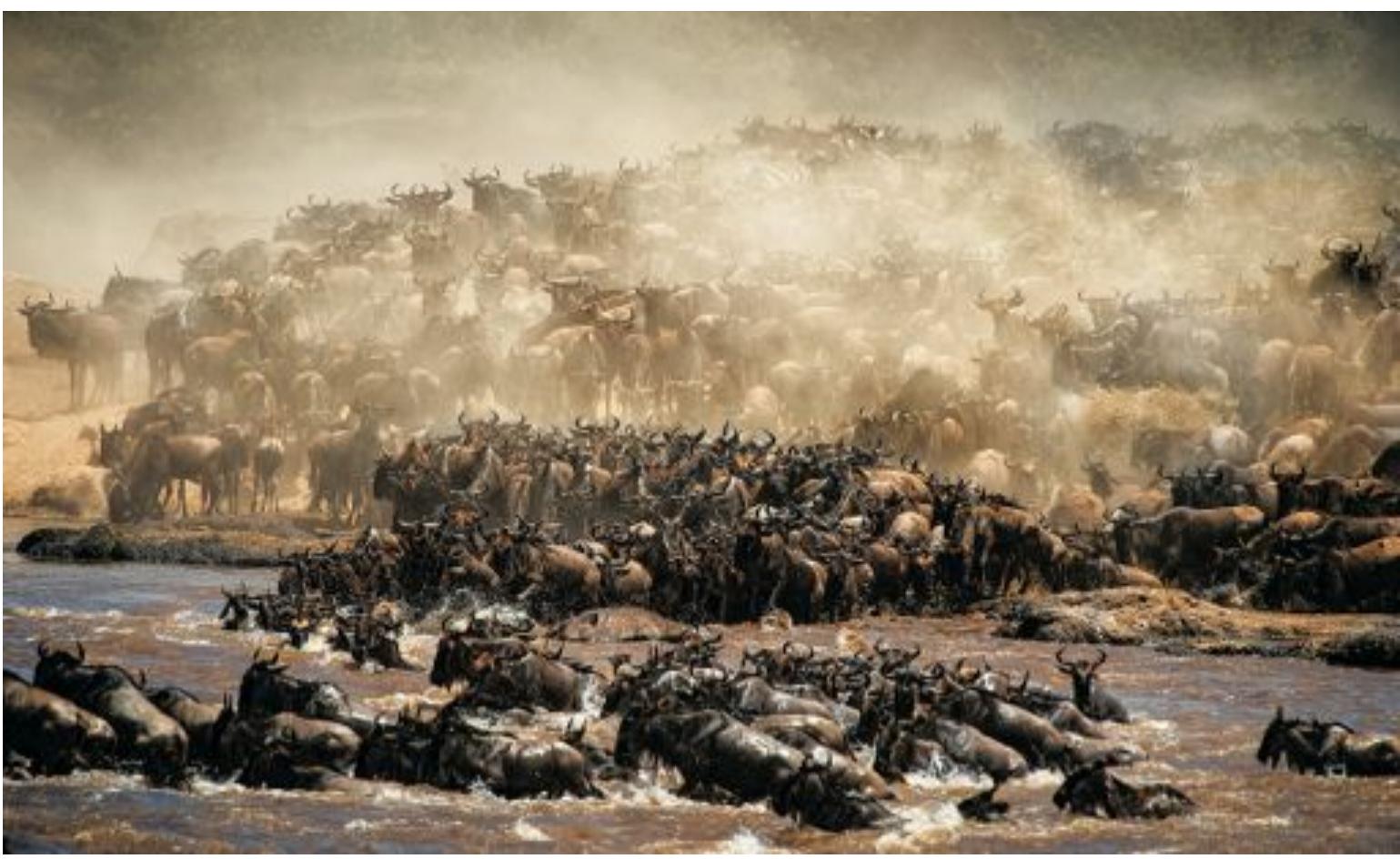
Wildebeest migration crossing the Mara River in Kenya, Africa. Nikon D4, AF-S VR Zoom-Nikkor 200-400mm F4G IF-ED lens, focal length 550mm, f/8 at 1/800 second, center-weighted metering mode, auto exposure mode, ISO equivalent 200.

Plan to go at the best time. Many species migrate or give birth at a particular time in a particular location. Plan your trip around these extraordinary events. This was photographed during the annual wildebeest migration crossing the Mara River in Kenya. It has been said to be the greatest wildlife show on earth. Remember to pull back and capture the whole story. The mass of the animals and the dust kicking up gives big impact to this image. Large numbers of any species will add impact.