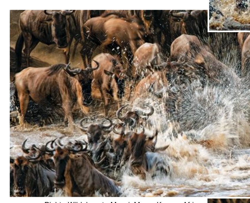
Right: Wildebeest, Masai Mara, Kenya, Africa, by Piper Mackay. Canon EOS-1D Mark III, Canon EOS-1D Mark III lens, focal length 200mm, f/40 at 1/30 second, evaluative metering mode, auto exposure mode, ISO equivalent 640.

Right: Wildebeest, Masai Mara, Kenya, Africa, by Piper Mackay. Canon EOS-1D Mark III, Canon EOS-1D Mark III lens, focal length 200mm, f/7.1 at 1/1600, evaluative metering mode, auto exposure mode, ISO equivalent 540.