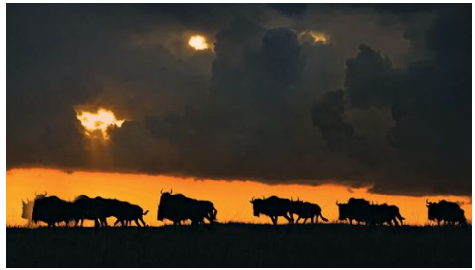
Wildebeest, Masai Mara, Kenya, Africa.

Backlighting generally creates a silhouette. You expose for the sky and the foreground will go black. You want to be lower than your subjects to be able to separate them from the ground. Otherwise, the horizon line will run through the middle of your subject and your subject will look like big blogs with no legs. Usually you want to separate the animals, nothing touching each other, or again they will look like one big blog. However, I loved the dramatic sky and how the line of wildebeest was perfectly framed between the horizon and dark clouds.